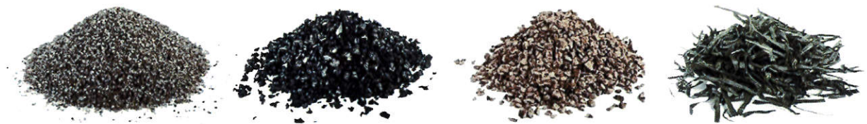
Figure 2: Products (sand, rubber granulate, backing, grass fibres (polyethylene)).

There are several different types of artificial turf. The turf, which is typically treated by Re-Match, either has SBR rubber or TPE rubber as rubber granulate.